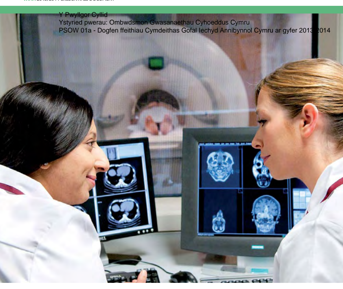
Investment in the latest equipment is essential for the care of our patients

The Mental Health sector provided 85,000 patient bed days in 2013-2014