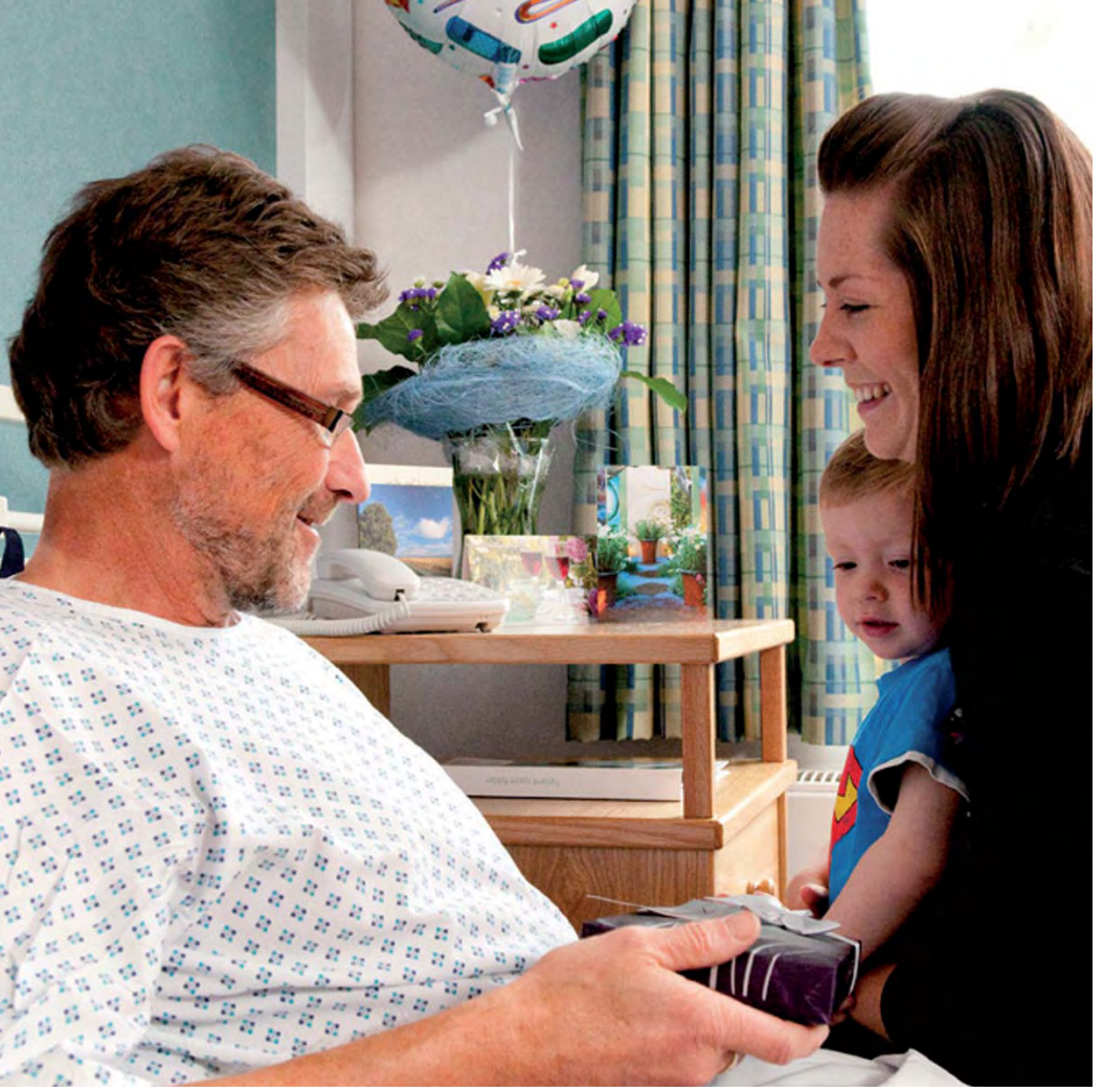
Gofalu am Gleifion dros Gymru